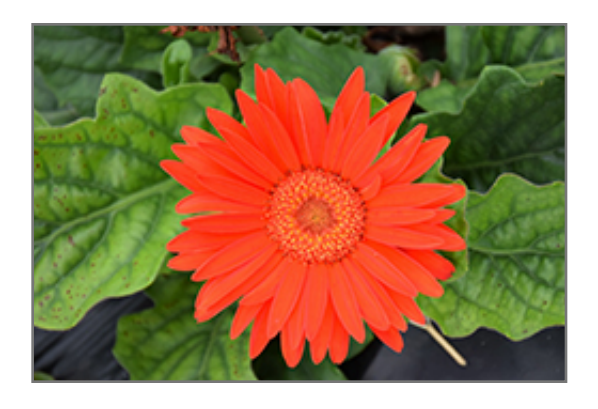
Jaguar Tangerine Gerbera Daisy flowers