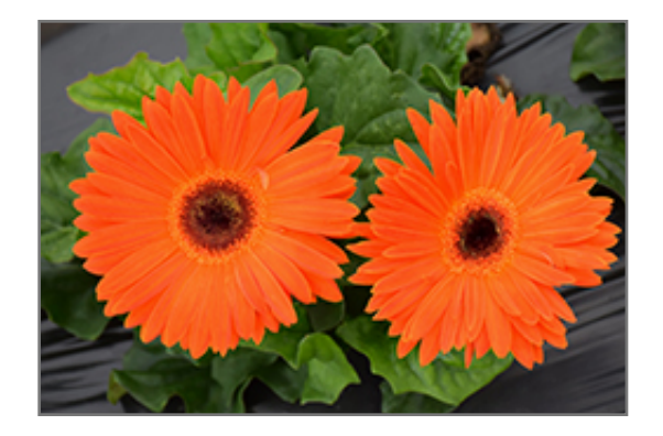
Jaguar Tangerine Dark Center Gerbera Daisy flowers