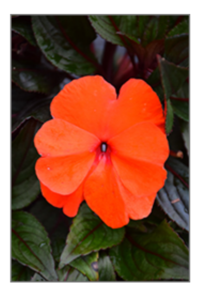
Super Sonic Flame New Guinea Impatiens flowers