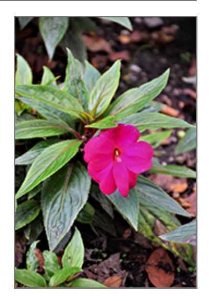
Magnum Purple New Guinea Impatiens flowers