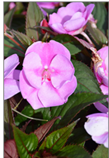
SunPatiens Vigorous Lavender Splash New Guinea Impatiens flowers