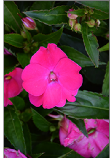
SunPatiens Vigorous Rose Pink New Guinea Impatiens flowers

SunPatiens Vigorous Rose Pink New Guinea Impatiens is recommended for the following landscape applications;