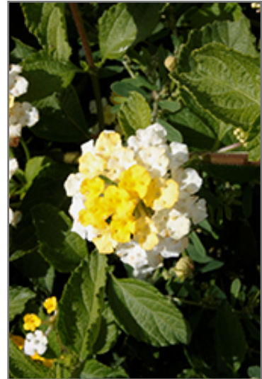
Landscape Bandana Lemon Zest Lantana flowers