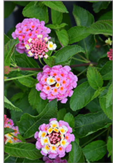
Landscape Bandana Pink Lantana flowers