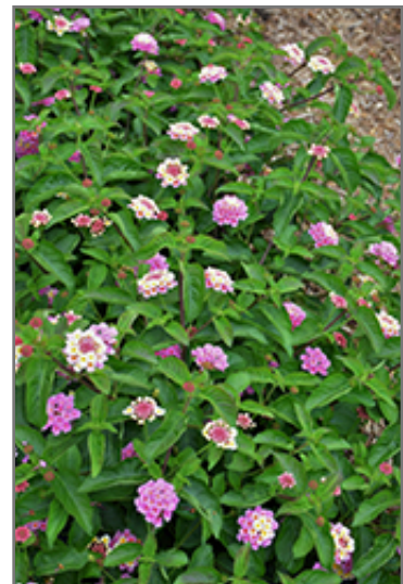
Landscape Bandana Pink Lantana in bloom