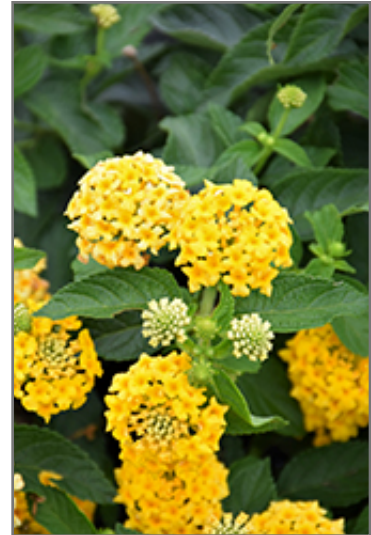
Landscape Bandana Yellow Lantana flowers