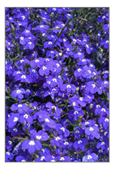
Techno Upright Cobalt Blue Lobelia flowers

This plant will require occasional maintenance and upkeep, and should not require much pruning, except when necessary, such as to remove dieback. It is a good choice for attracting butterflies to your yard. It has no significant negative characteristics.