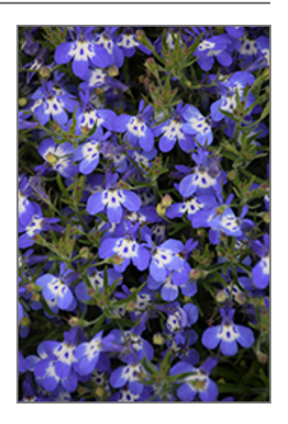
Hot Tiger Lobelia flowers

Hot Tiger Lobelia will grow to be about 12 inches tall at maturity, with a spread of 24 inches. When grown in masses or used as a bedding plant, individual plants should be spaced approximately 8 inches apart. Its foliage tends to remain dense right to the ground, not requiring facer plants in front. This fast-growing annual will normally live for one full growing season, needing replacement the following year.