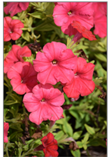
ColorRush Watermelon Red Petunia flowers