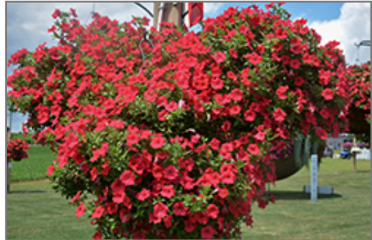
ColorRush Watermelon Red Petunia in bloom

ColorRush Watermelon Red Petunia will grow to be about 12 inches tall at maturity, with a spread of 30 inches. When grown in masses or used as a bedding plant, individual plants should be spaced approximately 24 inches apart. Its foliage tends to remain dense right to the ground, not requiring facer plants in front. This fast-growing annual will normally live for one full growing season, needing replacement the following year.