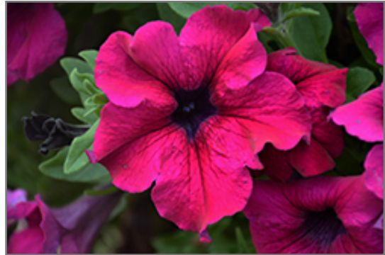
Sanguna Mega Purple Petunia flowers

Sanguna Mega Purple Petunia is recommended for the following landscape applications;