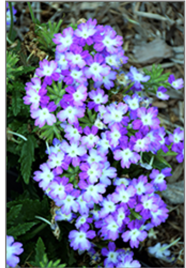
Hurricane Blue Verbena flowers