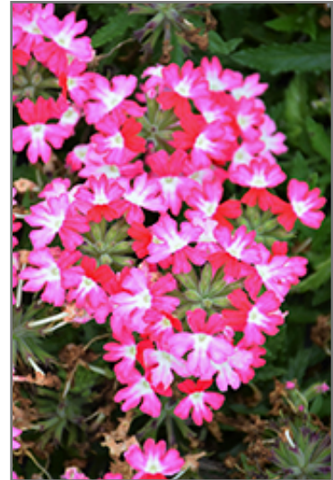
Hurricane Hot Pink Verbena flowers