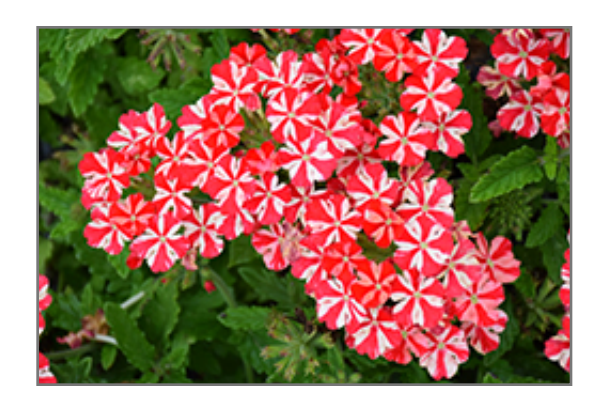
Lanai Compact Red Star Verbena flowers