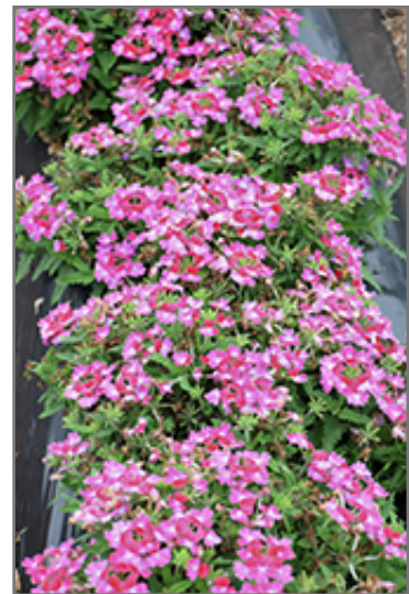
Lanai Upright Twister Rose Verbena in bloom