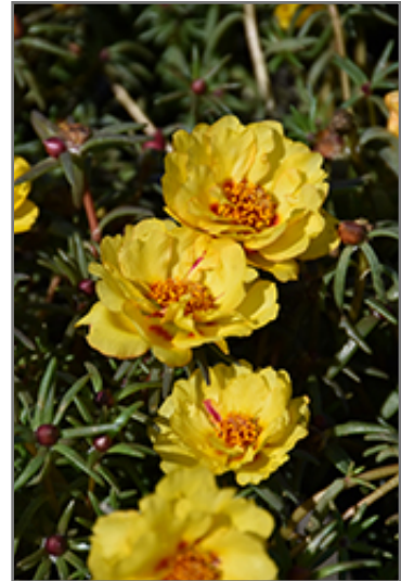
Happy Hour Banana Portulaca flowers