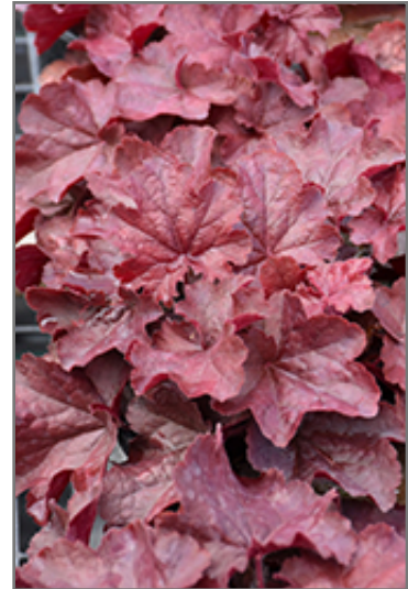
Northern Exposure Red Coral Bells foliage