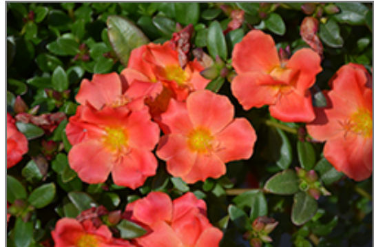
Pazzaz Orange Flare Portulaca flowers

Pazzaz Orange Flare Portulaca is recommended for the following landscape applications;