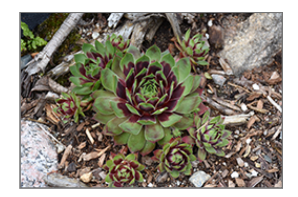
Killer Hens And Chicks