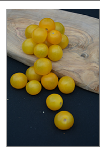
Sweet N' Neat Cherry Yellow Tomato fruit