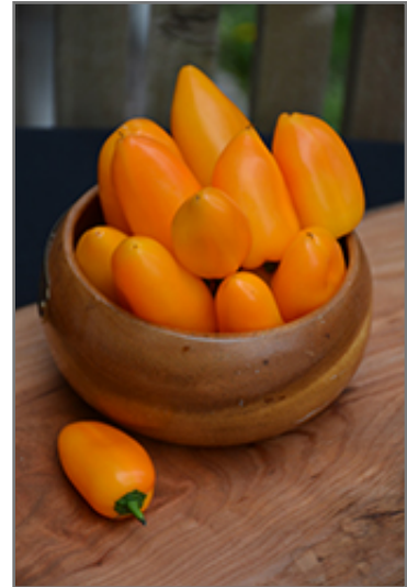
Lunchbox Yellow Sweet Pepper fruit

Lunchbox Yellow Sweet Pepper will grow to be about 3 feet tall at maturity, with a spread of 18 inches. When planted in rows, individual plants should be spaced approximately 18 inches apart. This vegetable plant is an annual, which means that it will grow for one season in your garden and then die after producing a crop.