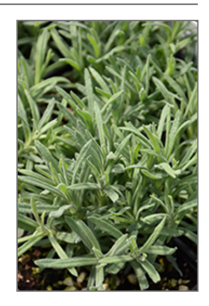
Blue Star Spanish Lavender foliage