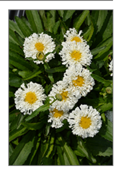
Realflor Real Snowball Shasta Daisy flowers