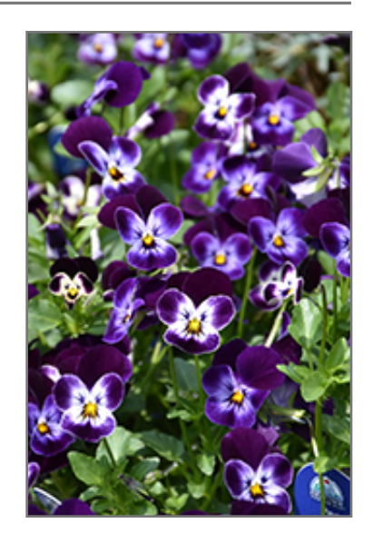
Sorbet Phantom Pansy flowers