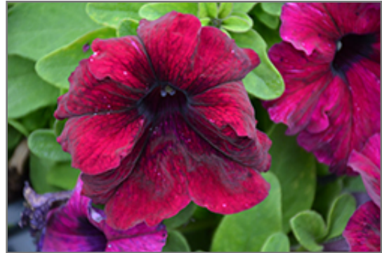
Success! HD Burgundy Petunia flowers

Success! HD Burgundy Petunia is recommended for the following landscape applications;