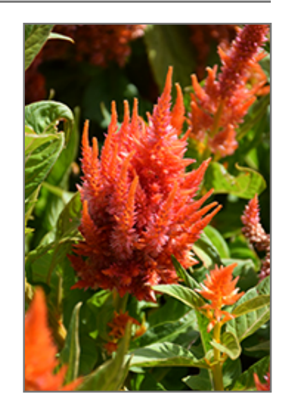
Fresh Look Orange Celosia flowers