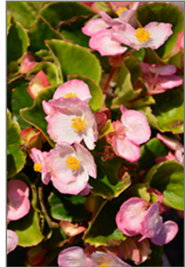
Sprint Plus Apple Blossom Begonia flowers

Sprint Plus Apple Blossom Begonia is recommended for the following landscape applications;