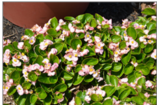
Sprint Plus Apple Blossom Begonia in bloom