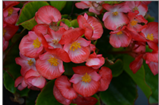
Sprint Plus Blush Begonia flowers

Sprint Plus Blush Begonia is recommended for the following landscape applications;