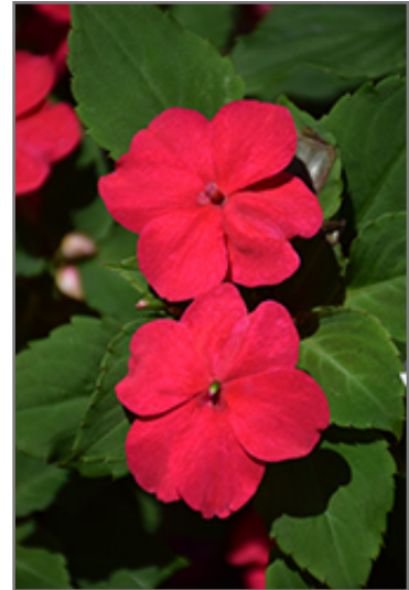
Imara XDR Rose Impatiens flowers