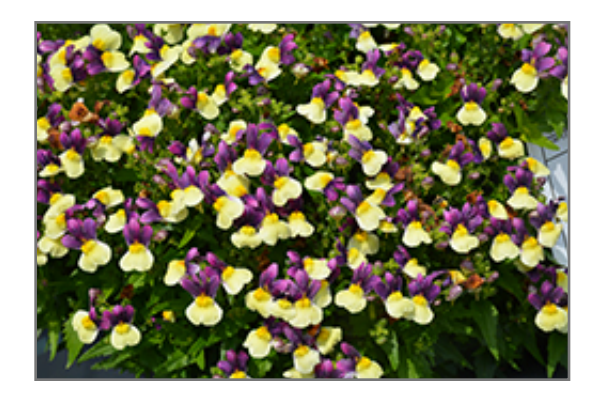
Escential Blueberry Custard Nemesia in bloom