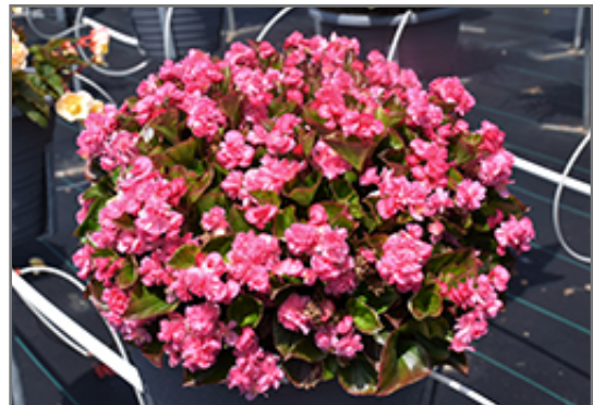
Double Up Pink Begonia in bloom