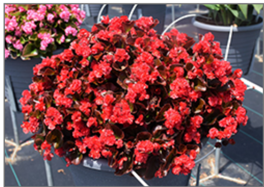
Double Up Red Begonia in bloom