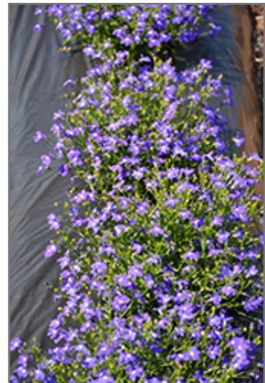
Lobelix Blue Lobelia in bloom