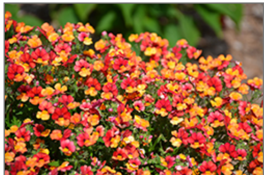
Babycakes Little Orange Nemesia flowers