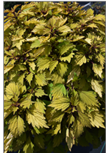
ColorBlaze Royale Pineapple Brandy Coleus foliage