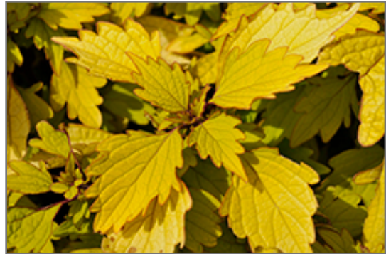
ColorBlaze Royale Pineapple Brandy Coleus foliage

ColorBlaze Royale Pineapple Brandy Coleus is recommended for the following landscape applications;