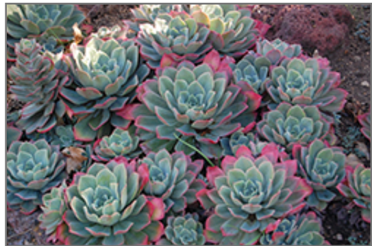
Blue Mist Echeveria