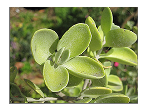
Silver Teaspoons foliage

This is a relatively low maintenance plant, and should not require much pruning, except when necessary, such as to remove dieback. It has no significant negative characteristics.