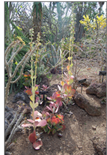
Paddle Plant in bloom