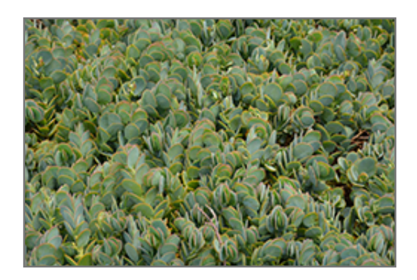
Marnier's Kalanchoe foliage

17999 WCR 4 Brighton, CO, 80603 phone: 303-775-9629 www.incolorme.com