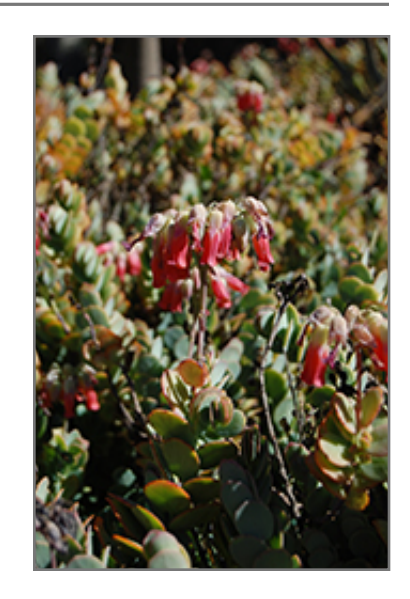
Marnier's Kalanchoe flowers

This plant does best in full sun to partial shade. It is very adaptable to both dry and moist growing conditions, but will not tolerate any standing water. It is considered to be drought-tolerant, and thus makes an ideal choice for a low-water garden or xeriscape application. It is not particular as to soil pH, but grows best in sandy soils. It is somewhat tolerant of urban pollution. This species is not originally from North America. It can be propagated by division.