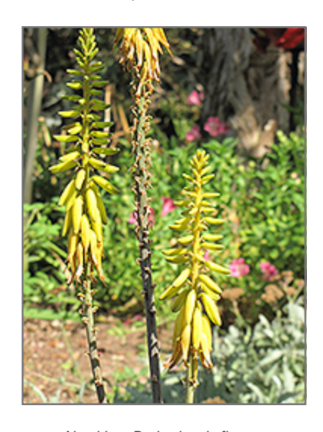
Aloe Vera Barbadensis flowers