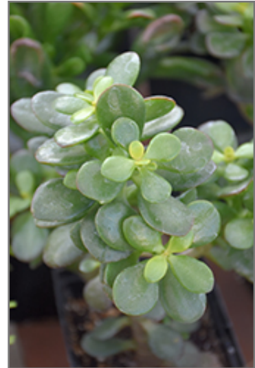
Baby Jade Plant foliage

When grown indoors, Baby Jade Plant can be expected to grow to be about 18 inches tall at maturity, with a spread of 20 inches. It grows at a slow rate, and under ideal conditions can be expected to live for approximately 15 years. This houseplant will do well in a location that gets either direct or indirect sunlight, although it will usually require a more brightly-lit environment than what artificial indoor lighting alone can provide. It prefers dry to average moisture levels with very well-drained soil, and may die if left in standing water for any length of time. This plant should be watered when the surface of the soil gets dry, and will need watering approximately once each week. Be aware that your particular watering schedule may vary depending on its location in the room, the pot size, plant size and other conditions; if in doubt, ask one of our experts in the store for advice. It is not particular as to soil pH, but grows best in sandy soil. Contact the store for specific recommendations on pre-mixed potting soil for this plant. Be warned that parts of this plant are known to be toxic to humans and animals, so special care should be exercised if growing it around children and pets.