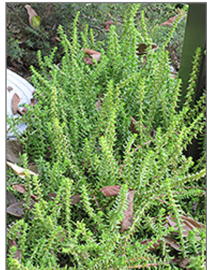
Watch Chain Crassula