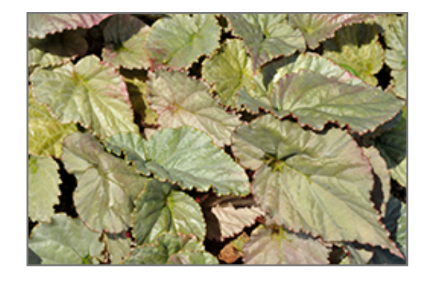
Silver Treasure Begonia foliage