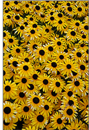
Viette's Little Suzy Coneflower flowers