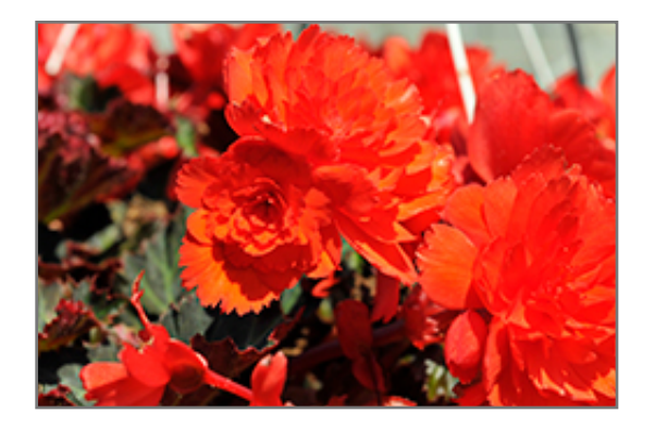
l'Conia Portofino Hot Coral Begonia flowers