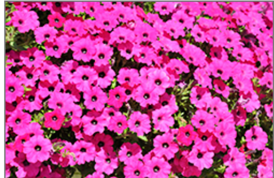
Itsy Magenta Petunia flowers

Itsy Magenta Petunia is recommended for the following landscape applications;