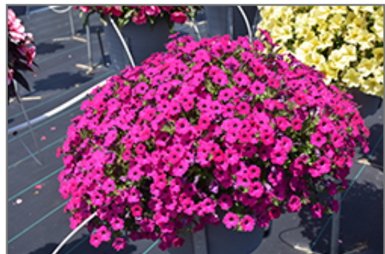
Itsy Magenta Petunia in bloom