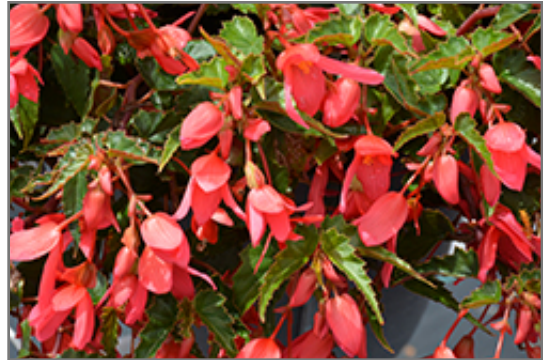
Groovy Rose Begonia flowers

Groovy Rose Begonia is recommended for the following landscape applications;