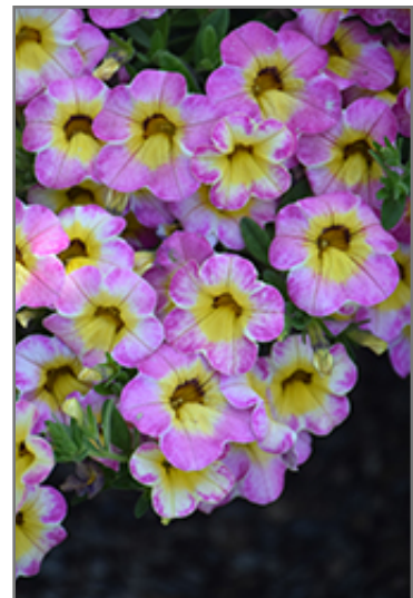
Cha-Cha Diva Hot Pink Calibrachoa flowers